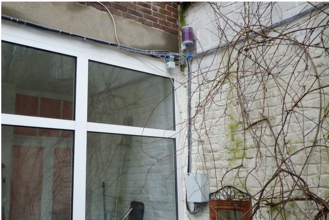
Electro-hydraulic leveling point mounted on an external wall